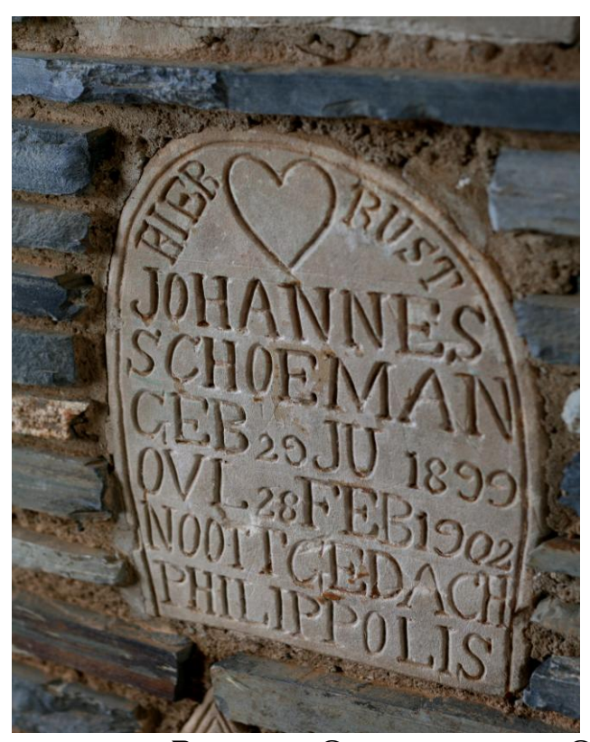
GRAVESTONE IN BETHULIE CONCENTRATION CAMP CEMETERY