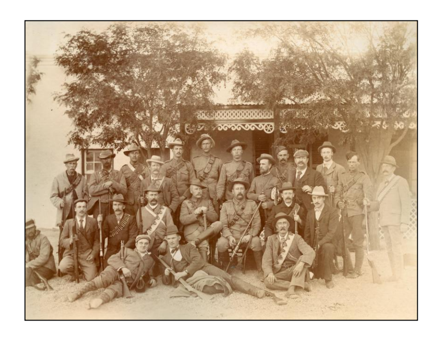
PHILIPPOLIS TOWN GUARD

their lives to basic issues of survival – securing food, protecting their household goods, keeping their families together, sending and receiving the odd letter, with no idea what dangers they would face in the future. The residents had to endure the upheaval of a forced relocation to concentration camps, where they resided for at least a year. During their absence, their unguarded properties were looted, damaged and destroyed by British troops and Burgher commandos.