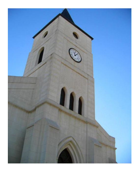
NG CHURCH, PHILIPPOLIS